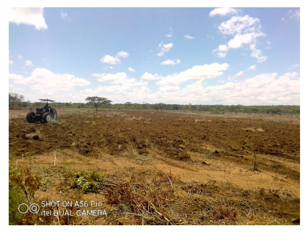
The first 2 hectares being worked on