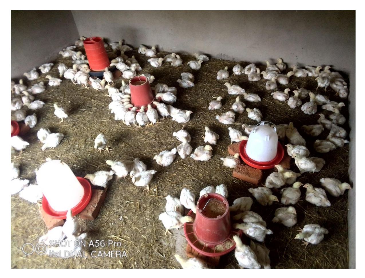
The new batch with 200 broilers